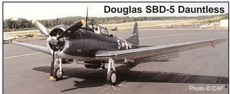
Douglas SBD-5 Dauntless

The "Bucket of Bolts" was repainted in 1991 with the RAF camouflage air transport scheme with invasion D-Day stripes. The colors are authentic down to the numbers on the side, which were on the aircraft that Col. Vic Hewes of the Dixie Wing flew in the service of the RAF in World War II during the invasion of Normandy.