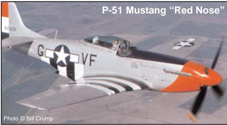
P-51 Mustang "Red Nose"