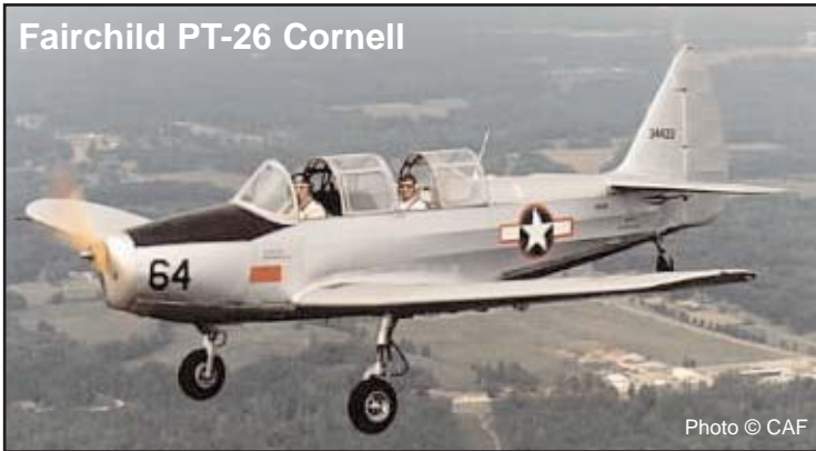
Fairchild PT-26 Cornell

American Mustangs were the highest-scoring US fighter in the European theater with 4,950 enemy aircraft destroyed. They were used as dive-bombers, escorts, ground-attackers, interceptors, and more, throughout 40 US Army Air Force fighter groups and 31 RAF squadrons. Post-war, P-51 Mustangs were used as high-performance racers.